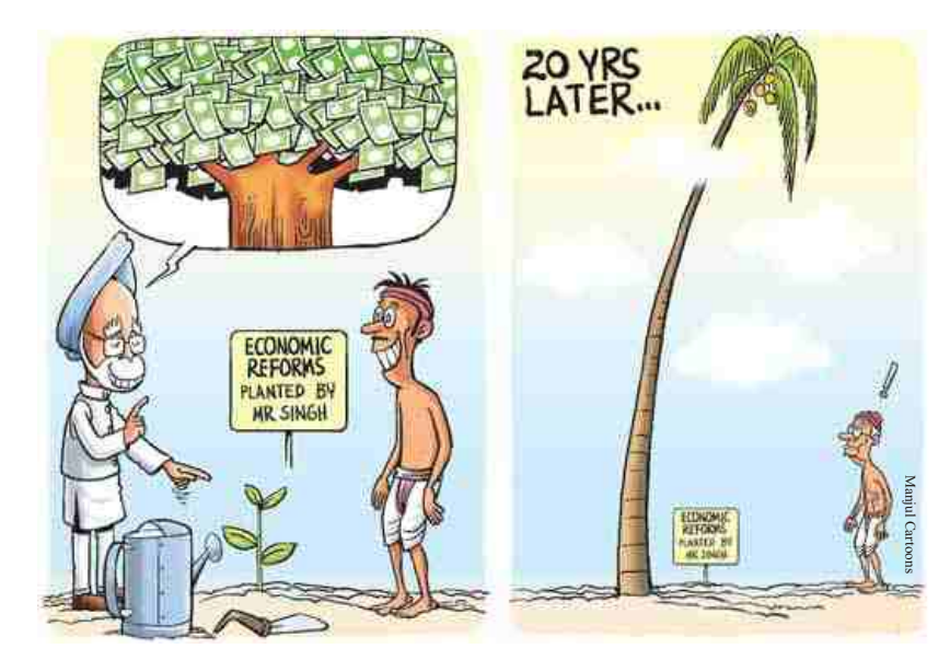
Most NAC-dictated laws and policies have been economically and fiscally flawed

The Forest Rights Act intended to recognise and vest the forest rights and occupation in forest-land, in forest dwelling Scheduled Tribes and other traditional forest dwellers. Although, the law has not improved the condition of Scheduled Tribes or other forest dwellers, yet it has become a tool in the hands of those who are doctrinally opposed to private sector-led industrialisation.