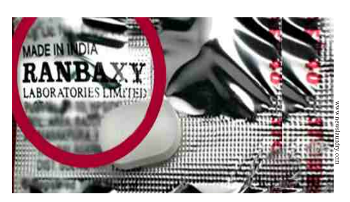
It is unlikely that independent directors on Ranbaxy Board had no exposure to corporate governance models

Clause 149 (11) of the Companies Bill, 2012, provides that an independent director shall be liable "only in respect of such acts of omission or commission by a company which had occurred with his knowledge,