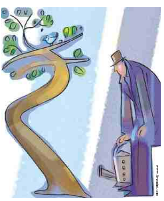
Two decades on, India is still an attractive destination for foreign funds. The New Asia shows why

India is also Asia's seventh most corrupt country and ranks at the bottom - just above Cambodia and the Philippines - in business efficiency. In any case, India is just one of 16 countries James and Merchant examine in the context of what they call the "Five Factors" that