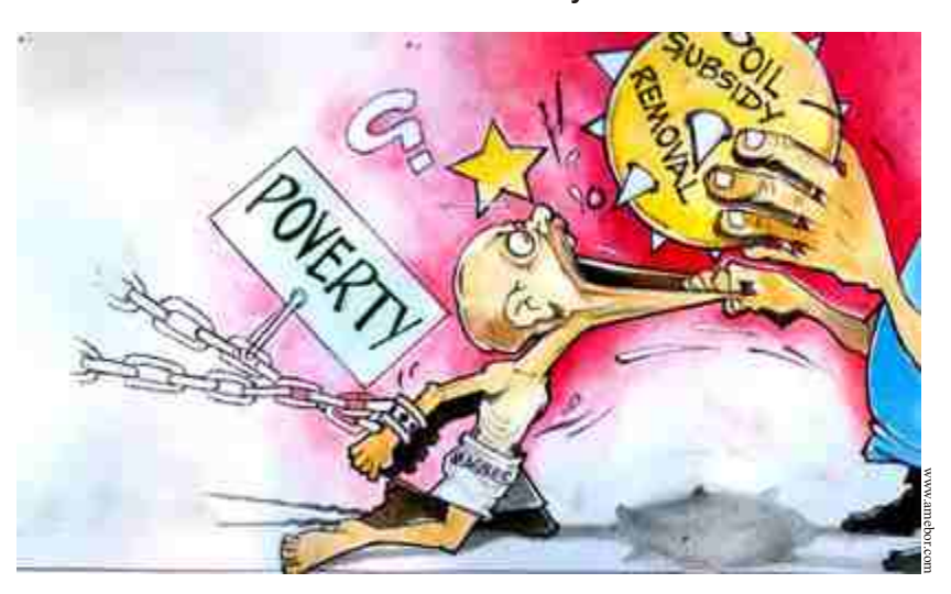
A new IMF working paper shows that India's fuel subsidies are both fiscally costly and socially regressive

new IMF working paper (http://bit.ly/137nyEm) shows clearly that India's fuel subsidies are both fiscally costly and socially regressive. In per capita terms, the top 10 percent of Indian households spends more than 20 times as much on fuel as the poorest 10 percent (including both direct and indirect consumption the latter being when food, for example, is transported to the market using subsidised fuel).