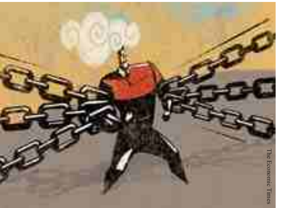
Rapid and inclusive growth in the medium term does not look too likely if one examines the array of unattended constraints

increasing "politicisation" of public administration at all levels and the growing spread of bribery and corruption in government-citizen transactions.