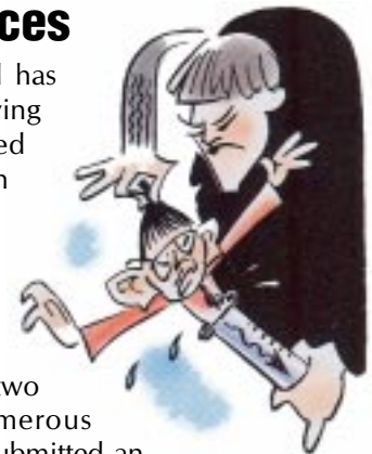
Down to Earth

This is a landmark decision by the Authority, not least because it is the first abuse of dominance case to be concluded since the Authority was founded in 2003. In addition, the fine imposed on Portugal Telecom is the largest ever issued in Portugal for anticompetitive restrictive practices. (ILO, 13.10.07)