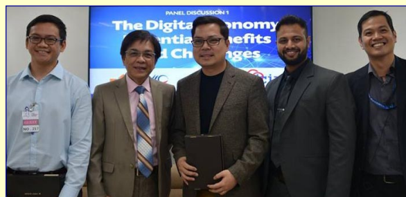
Participants at the conference on 'Digital Economy: Potential Benefits, Challenges and Implications for Regulations'