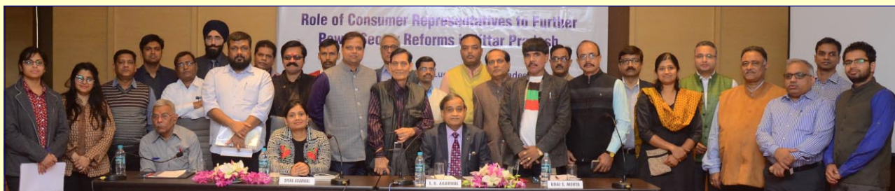
Participants at the workshop on 'Role of Consumer Representatives to Further Power Sector Reforms'

CUTS International with support from Shakti Sustainable Energy Foundation (SSEF) organised a workshop on 'Role of Consumer Representatives to Further Power Sector Reforms in Uttar Pradesh' in Lucknow on November 27, 2017. The purpose of the event was to bring together various stakeholders on a common platform and provide them a space for interaction and discussion, and building a strategy for policy changes in the state.