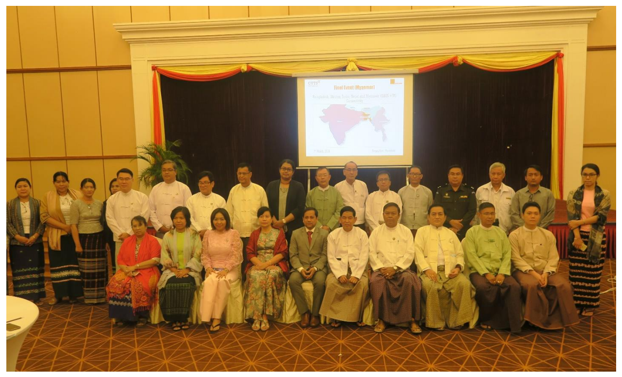
(Participants at the Final Event (Myanmar) for Bangladesh, Bhutan, India, Nepal and Myanmar (BBIN+M) Connectivity)

Grand Ballroom (1), Hotel Max, Nay Pyi Taw, Myanmar on 7th March, 2018