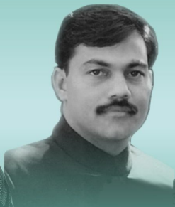
Ravi Jain Secretary and Transport Commissioner Government of Rajasthan