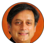
SHASHI THAROOR Member of Parliament Lok Sabha