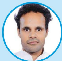
RITESH PANDEY Member of Parliament Lok Sabha