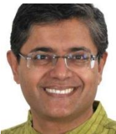
Baijayant 'Jay' Panda National Vice President and Spokesperson Bhartiya Janata Party and Former Member of Parliament, India

Baijayant 'Jay' Panda is the National Vice President and Spokesperson of Bharatiya Janata Party. He has been a four-time MP of India. He was elected to his second term (2014-2019) in the Lok Sabha from Kendrapara Constituency, Odisha. Earlier, he had been elected to the Lok Sabha in May 2009 as well as twice earlier to the Rajya Sabha in 2000 and 2006, also from the State of Odisha. Panda graduated from the Michigan Technological University and worked in the corporate sector before joining politics. He had helped to form the erstwhile Young Parliamentarians Forum and was its Convener. He has also been associated with the India-USA Forum of Parliamentarians since 2001 and was its Chairman for 15 years.